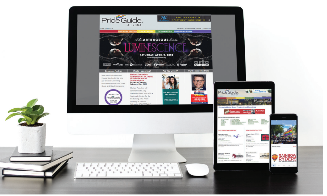
Web + Mobile App

www.GayArizona.com www.PrideGuideUSA.com