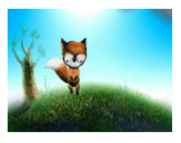
The Little Fox

A neon-pink inflatable pop monster, incarnating both a money spider and a piggy savings bank.